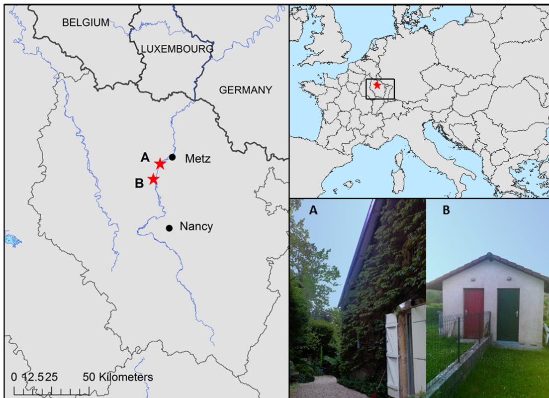
Fig 1. Geographic location of roost sites A (Ancy-sur-Moselle) and B (Pagny-sur-Moselle).

Capture-recapture sessions were completed in summer (July and August) and spring (May) between 2009 and 2015 (during 7 years) for site A, and between 2011 and 2015 (during 5