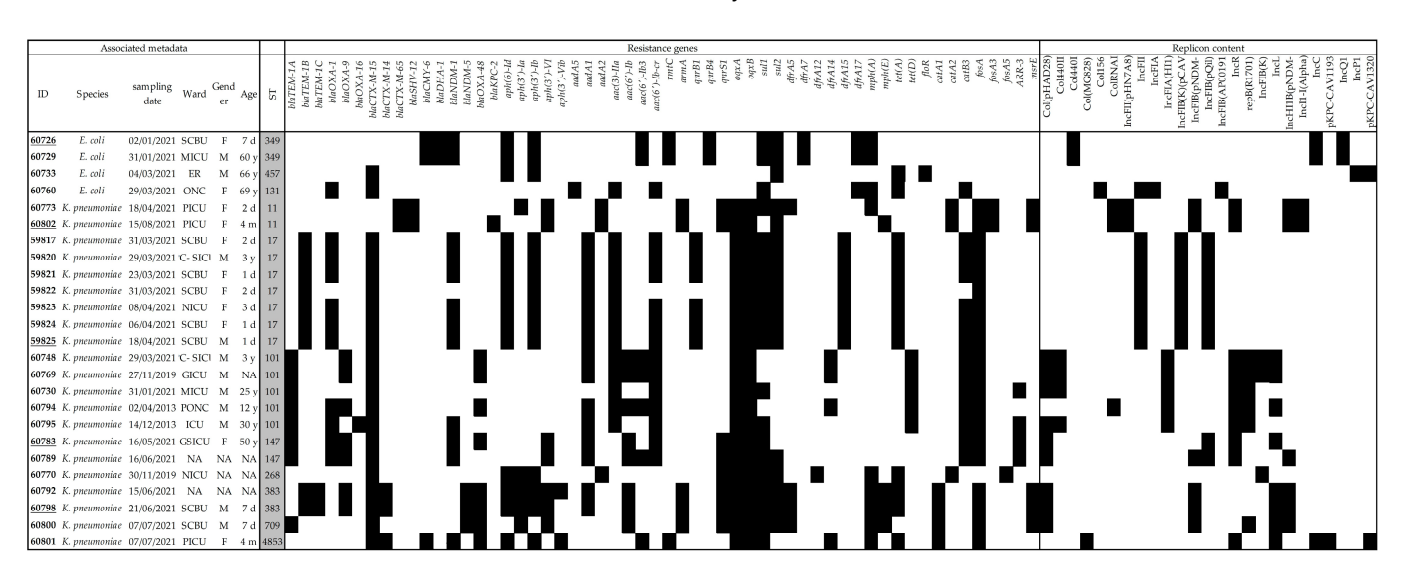
Figure 2. Heatmap of all resistance genes and replicons identified in all Illumina-sequenced isolates. Underlined IDs are those that were long-read sequenced. The presence of the gene is marked by a black square, and its absence by a white one.

Genomic analyses of the 21 K. pneumoniae and five E. coli fully sequenced isolates led to the identification of 56 different genes conferring resistance to a large number of antibiotic families and molecules (Figure 2). Different patterns of resistance could be seen depending on the different STs. All of CTX-M group 1 were subtyped as CTX-M-15; on the contrary, the CTX-M group 9 either belonged to the subtype CTX-M-65 when found with SHV-12 and associated with ST11, or to the subtype CTX-M-14 when found with CTX-M-15 in ST383 and its SLV ST4853. Only the bla_{\rm OXA-48} variant was identified and the KPC gene belonged to bla_{\rm KPC-2} . On the contrary, two types of bla_{\rm NDM} genes were found, namely, bla_{\rm NDM-1} associated with ST17, ST147 and ST101 and bla_{\rm NDM-5} associated with ST383, ST4853 and ST709. Finally, bla_{\rm CMY-6} was found in two E. coli isolates.