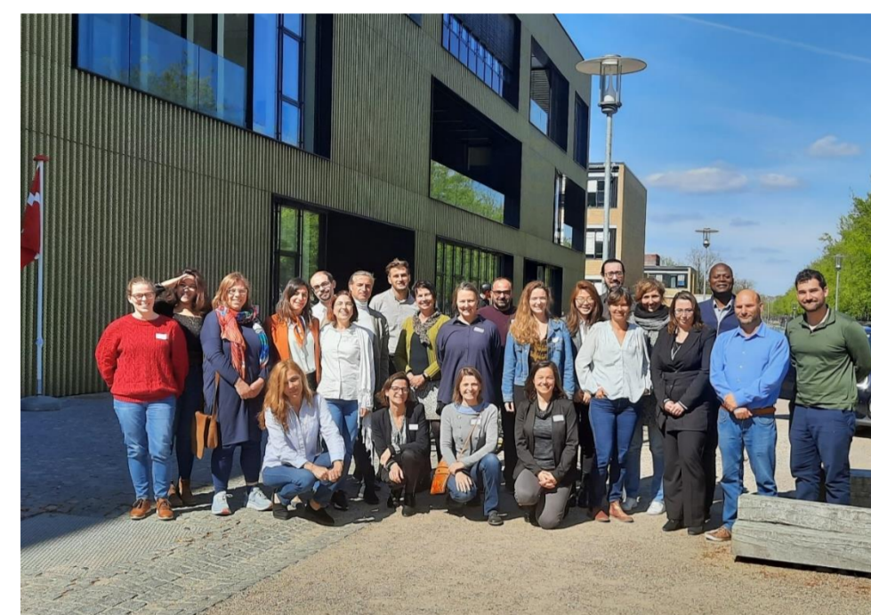
Group photos at COEvalAMR workshop, 4 th ICAHS confer., May 2022, Copenhagen (DK) ( https://icahs4.org/workshops ), and Annual co-ordination meeting, AgroVet campus, Grugliasco-Turin (I), June 2023