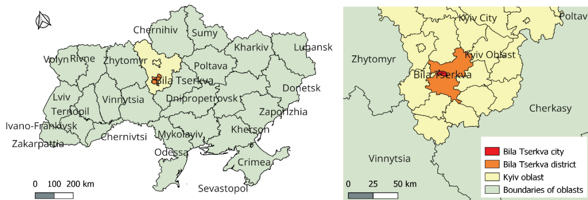
Fig. 1. Study area in Bila Tserkva (marked in orange)

Study area. The study was conducted in the city of Bila Tserkva, which is located in the central part of Ukraine (Fig. 1). It is the biggest city of Kyiv oblast with an area of 67.84 km 2 . In 2019 the estimated human population was about 210 000 people, according to the State Statistics Service of Ukraine.