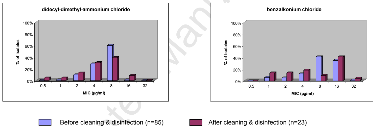
Fig. 2. Distribution of quaternary ammonium MICs of C. jejuni isolates collected before and after cleaning and disinfection on surfaces of slaughterhouse equipment